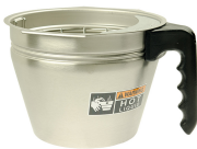
FUNNEL ASSY, SST (DUAL/SGL)