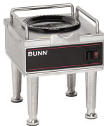
RWS1, 120V-SATIN NKL LEGS