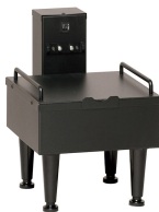
1SH STAND,120V BLK