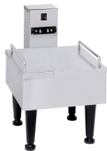
1SH STAND, 120V