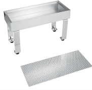
DRIP TRAY ASSY, SST- PERF CVR