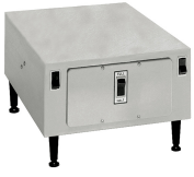
KIT LEG EXTENSION-4.0 LG