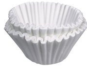
FILTERS,U3 18x7 252CS 252/1 36/CL