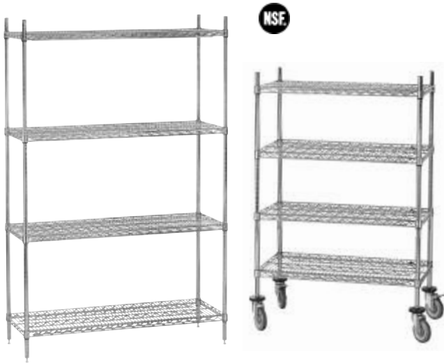
with Optional Casters