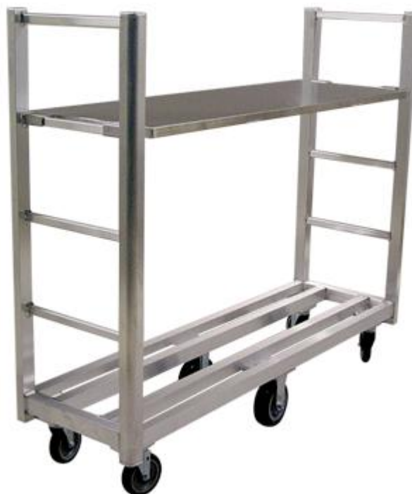
Model #95762 with #95762RS

These carts carry a Lifetime Guarantee against rust and corrosion and also carry a Five-Year Guarantee against workmanship and material defects.