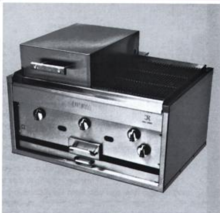
KC-36 WITH OPTIONAL SMOKE HOOD