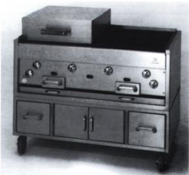
KC-48 WITH OPTIONAL SMOKE HOOD, STAINLESS STEEL ENCLOSED STAND AND CASTERS