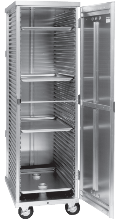
102-ST-1841E (Pans not included)